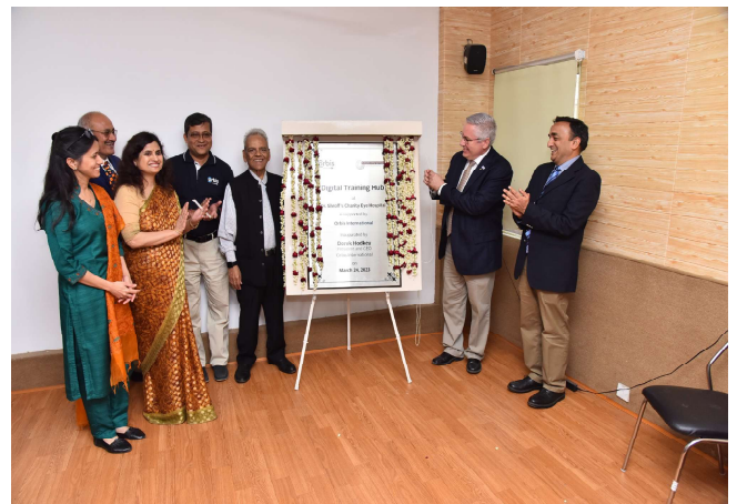
SCEH with support of Orbis International, inaugurated Digital Training Hub at SCEH Delhi