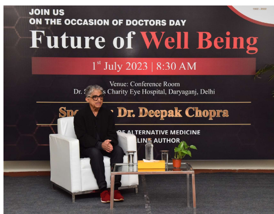
Visit by Dr. Deepak Chopra for Doctors' Day celebration