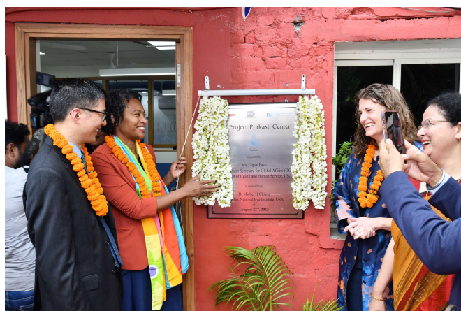
SCEH and National Eye Institute (NEI), part of U.S. National Institutes of Health (NIH) inaugurated a dedicated centre for Project Prakash