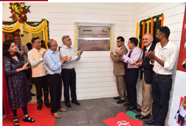
SCEH inaugurated Shroff-Pandorum Centre for Ocular Regeneration (SP-CORE) in partnership with Pandorum Technologies