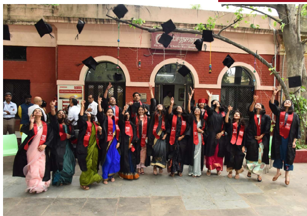
Long-term ophthalmology fellows Batch 2022 graduated from Standard Chartered -Shroff's Eye Care Education Academy