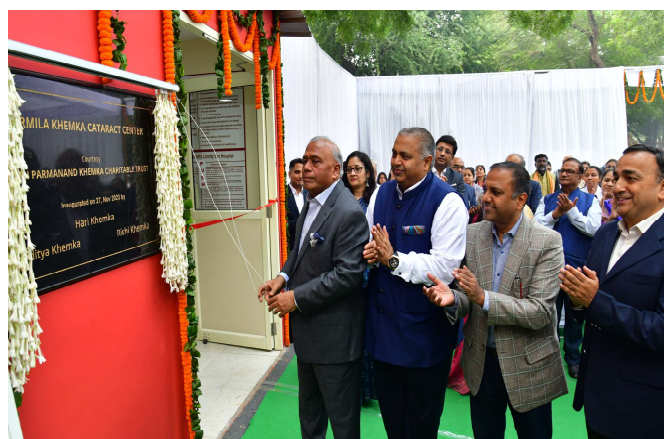
SCEH inaugurated Urmila Khemka Cataract Centre courtesy Seth Paramanand Charitable Trust in collaboration with the Rotary Club of Delhi South

Checkout the previous editions of our newsletter on our website: https://www.sceh.net