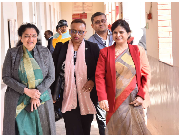
Orbis team launched Children's Eye Centre at SCEH Saharanpur centre